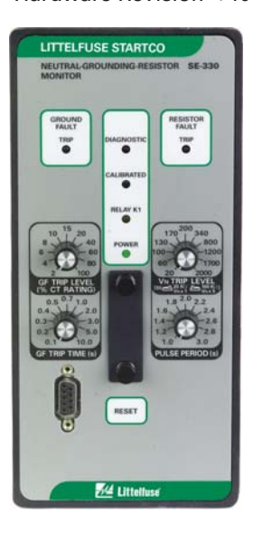
Figure 1. New and Old SE-330 Faceplates.

Old Revision SE-330 Hardware Revision < 10